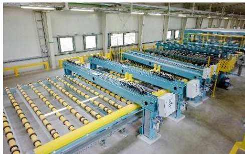
The cutting technology at AGC f | glass has been in operation since 2009. The service teams from AGC f | glass and Grenzebach jointly take care of maintenance.